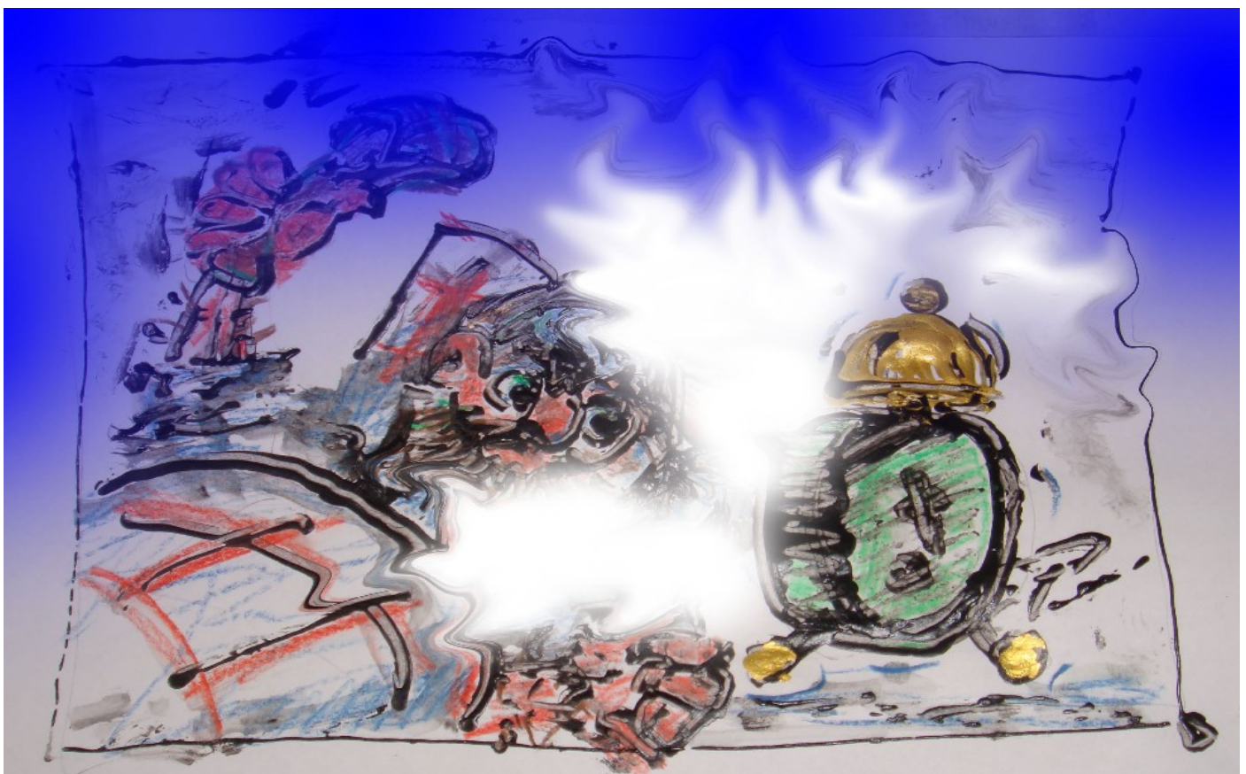
Fig.3 Blue - Light - Alarm - Clock